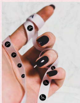
Semi-Permanent Nail Polish