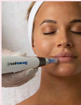
Collagen Induction Therapy