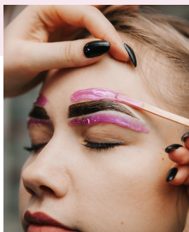
LASH & BROW